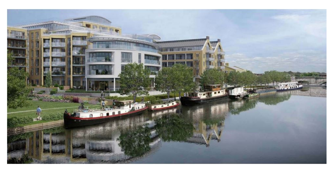
Figure 2. Narrowboats moored next to Kew Bridge in London [1]

The State of the Surroundings Scenarios (SSS) evaluate the impact strength of individual processes (factors) on the research subject. The knowledge of the scenario creators and consultants are the basis of the evaluations.