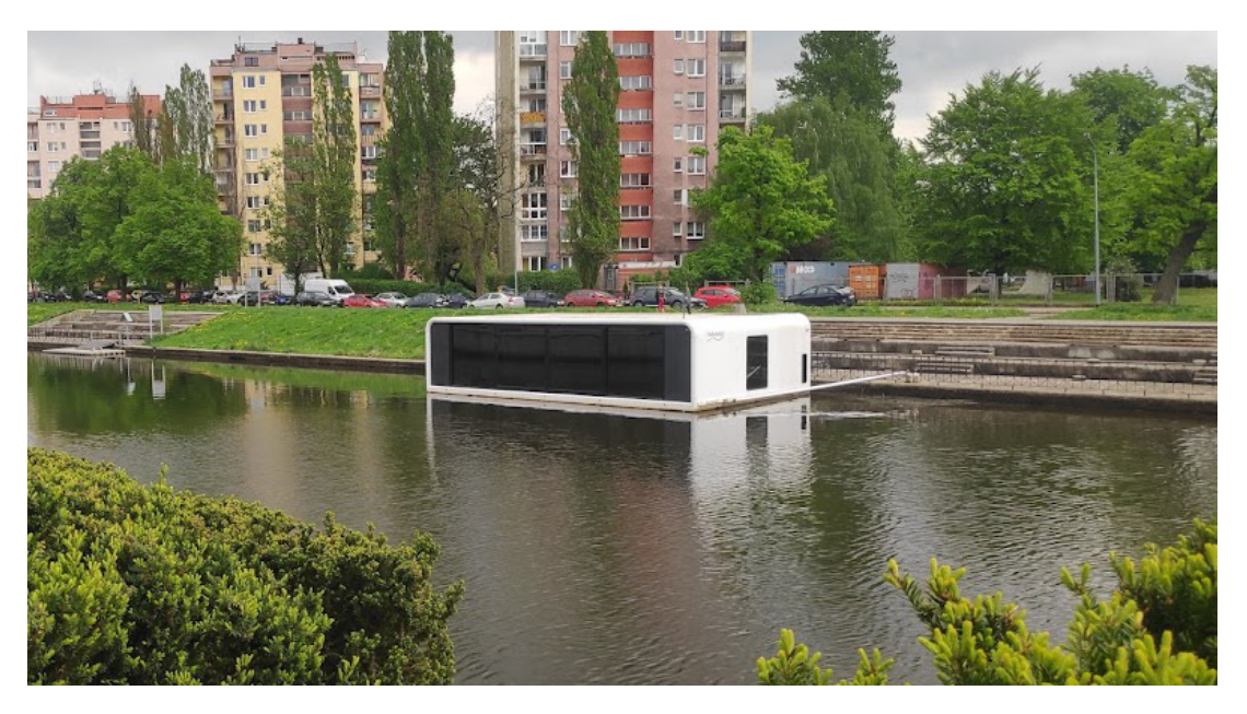
Figure 4. Floating house located in the center of Gdańsk, Poland [18]