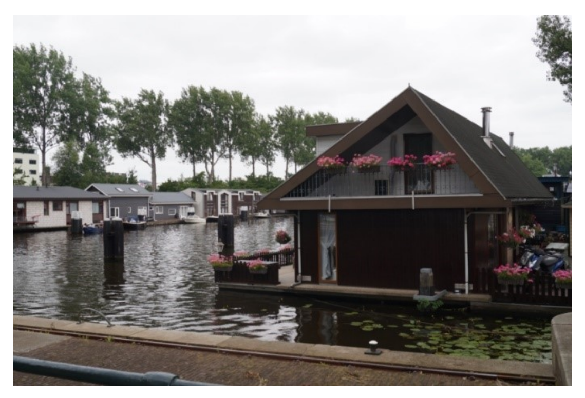
Figure 1. Estate of floating homes in Amsterdam [16]