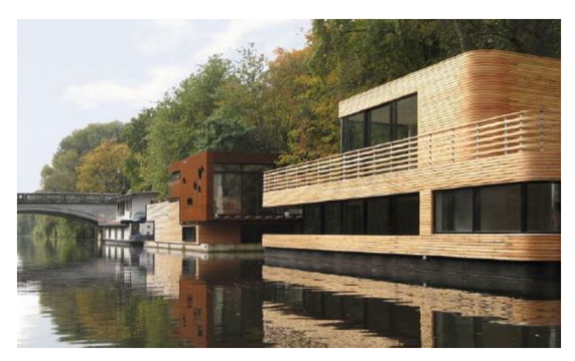
Figure 3. Floating House in Eibekkanaal, Hamurg, Germany [17]